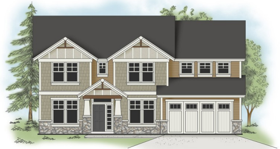
2999 Square Feet