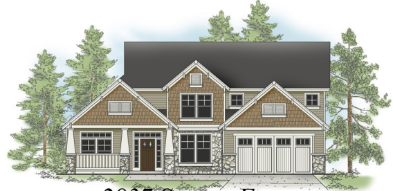
2837 Square Feet